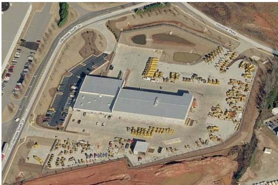
(Yancey Brothers service facility and offices in McDonough, Georgia)

SOME OF OUR EXPERIENCE INCLUDES THE FORT GORDON ENTERTAINMENT FACILITIES RENOVATION , WHERE WE PROVIDED THE ENGINEERING SERVICES FOR RENOVATION OF AN EXISTING +18,000 SQ-FT. ENTERTAINMENT HALL.