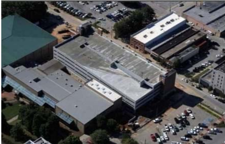
Georgia Mountain Parking Deck Expansion in Gainesville, Georgia

ONE OF OUR MOST RECENT PROJECTS WAS A PARKING DECK FOR A CARMAX AUTO STORE IN BURBANK, CALIFORNIA ( see picture on the upper-left corner of the page ). THE SINGLE LEVEL, 66,000 SQ-FT ELEVATED PARKING DECK WAS STRUCTURALLY CHALLENGING DUE TO THE FACT THAT IT WAS LOCATED IN A HIGH SEISMIC "4" REGION. THE ELEVATED DECK NOT ONLY SERVED AS PARKING, BUT IT ALSO SUPPORTED A CONCRETE MASONRY SERVICE FACILITY. CONCRETE MOMENT FRAMES AND SHEAR WALLS PROVIDED LATERAL SUPPORT. THE DECK WAS SUPPORTED BY PRE-CAST BEAMS.