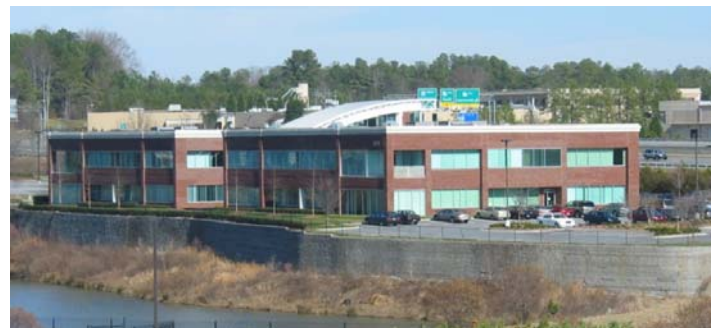
(Pinebrook II Office Park in Lawrenceville, Georgia)