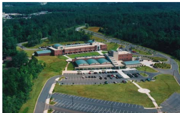
(Carroll Technical Institute – Douglasville Satellite Center – Carrollton, Georgia)