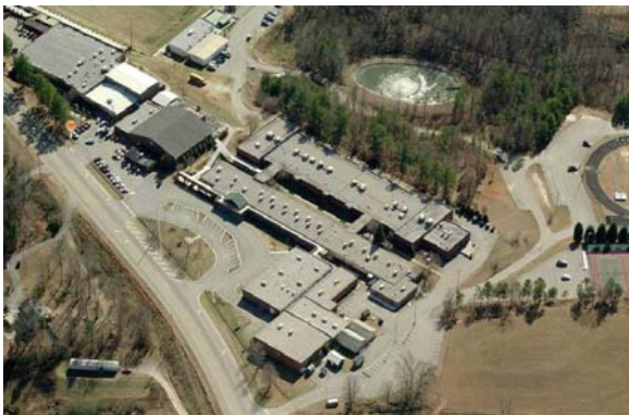
(North Hall County Middle / High School – Gainesville, Georgia)