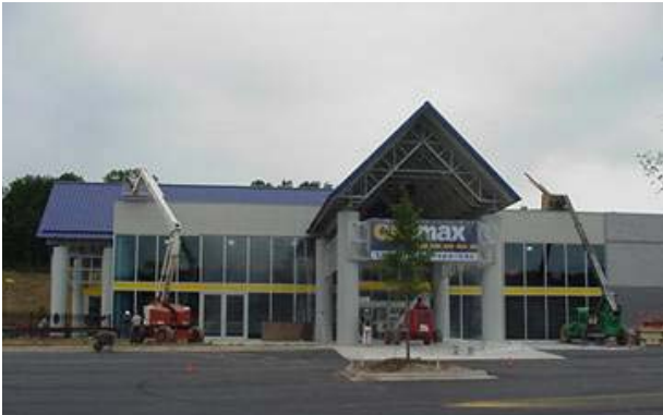
Hoover, Alabama Store

SINCE 2001, OUR FIRM HAS DESIGNED OVER 100 AUTOMOTIVE DEALERSHIPS THROUGHOUT THE COUNTRY. WE MAINTAIN THE NATIONAL PROTOTYPICAL PLANS (FOR BOTH CIVIL AND STRUCTURAL DISCIPLINES). WE ALSO PERFORM THE PEER REVIEW EVALUATION FOR OTHER ENGINEERS.