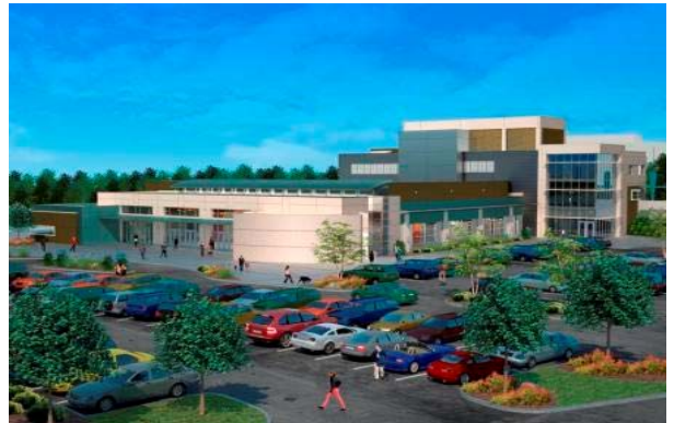
(Lanier Technical College Expansion in Cumming, Georgia)