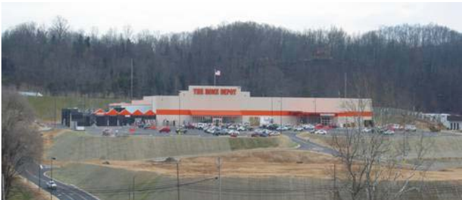
Bristol, Virginia Store