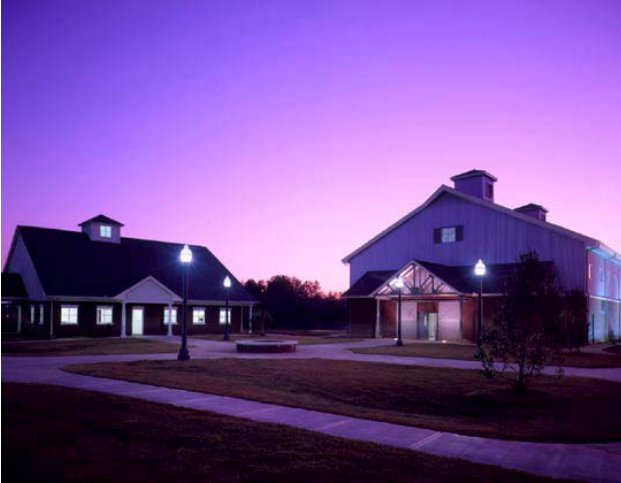
(Taylor Farm Park, in Paulding County, Georgia)