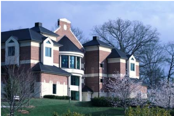
(Rabun Gap - Nacoochee School Arts and Technology)