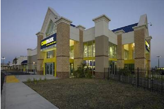
Ontario, California Store