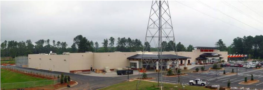
Spartanburg, South Carolina Store

THE TERMS OF THE CONTRACT WITH HOME DEPOT ON THE SOUTHEASTERN DEVELOPMENT PROGRAM GRANTED US THE ENGINEERING SERVICES ON 1 OF EVERY 3 HOME DEPOT STORES IN THE SOUTHEASTERN UNITED STATES (MS TO VA) FROM 2003 TO 2008. AS PART OF OUR CONTRACT, WE WORKED WITH THE SITE DEVELOPMENT CONSULTANTS TO DEVELOP PRELIMINARY ENGINEERING PLANS FOR INITIAL BUDGETING. OUR OVERALL SCOPE INCLUDED INITIAL SITE ANALYSIS, PRELIMINARY SITE DESIGN AND SITE WORK BUDGET, CONSTRUCTION DOCUMENT PREPARATION, CONSTRUCTION ADMINISTRATION, AND VALUE ENGINEERING.