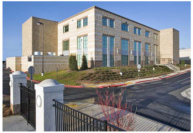
(The Weber School in Sandy Springs, Georgia)

ANOTHER EXAMPLE IS THE SOUTHERN POLYTECHNIC & STATE UNIVERSITY STUDENT HOUSING AND DINING HALL (Pictured below). THIS IS A LEED-SILVER PROJECT , LYING ON A 9 ACRE SITE, CONSISTING OF THE DESIGN OF A 600-BED DORM FACILITY AS WELL AS THE COORDINATION WITH THE PLANNING OF THE ADJACENT PARKING DECK.